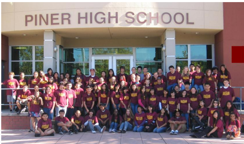
ECM Freshman Class of 2011-2012

All students taking JC classes need to check their SRJC account balance on "My Cubby" before registering for classes. Students are responsible for paying their health fee of $17 each semester they are enrolled for courses.